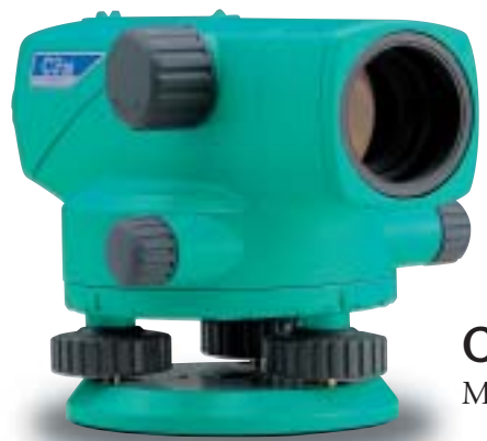
C330 Magnification 22x