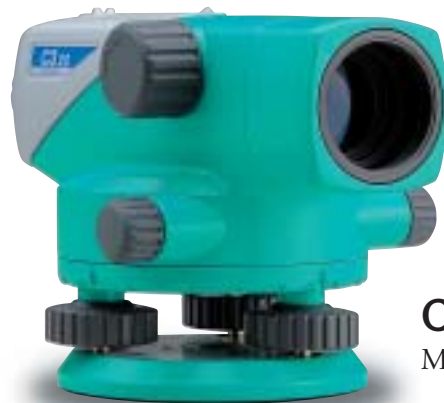
C320 Magnification 24x