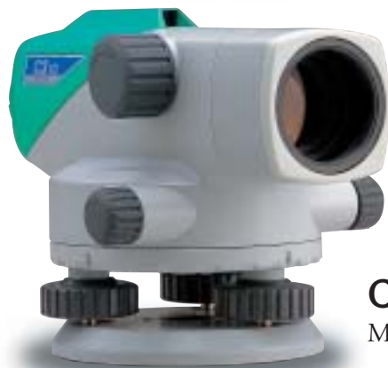
C310 Magnification 26x