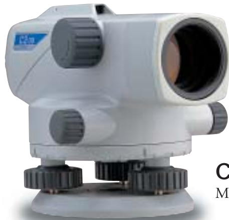
C300 Magnification 28x

All C3 models meet JIS grade 4 specification for waterproofing (this complies with International Electrotechnical Commission Standard, Class IPX4).