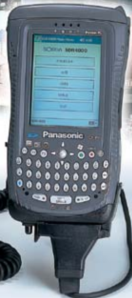
SDR4000 Control Terminal