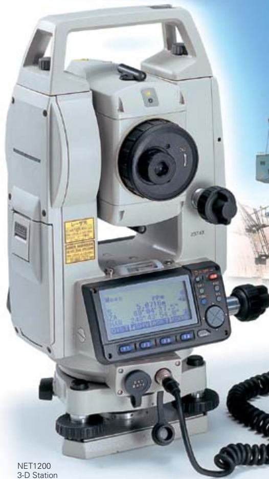
NET1200 3-D Station