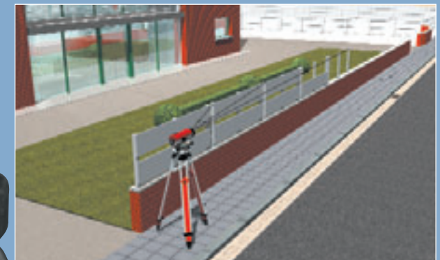
Level up with the Pentax AP-100 Series Levels