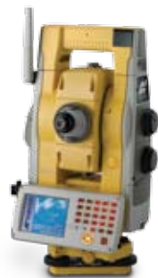
GPT-9000A/GTS-900A SERIES Advanced Robotic Instrument System

Topcon's new 9000A-series Robotic Systems: Superior Technology - Superior Design - Superior Performance and Value: only from Topcon, the World Leader in Precision Measurement Technology.